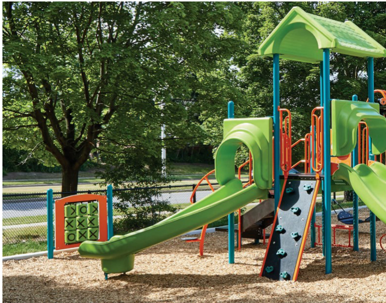
Example playground equipment with slides and climbing features for ages 5-12 and additional elements for ages 2-5.