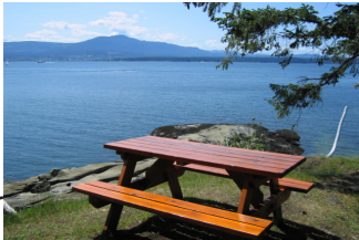
Two new picnic tables