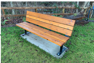
Four new benches

Enhance entryway with boulders, bollard, signage