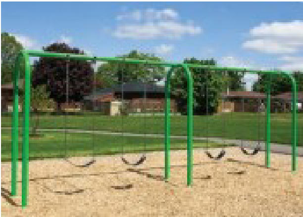
New swing set