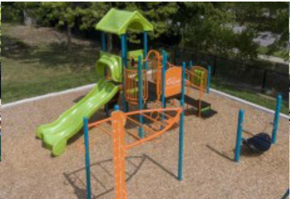
Example monkey bars