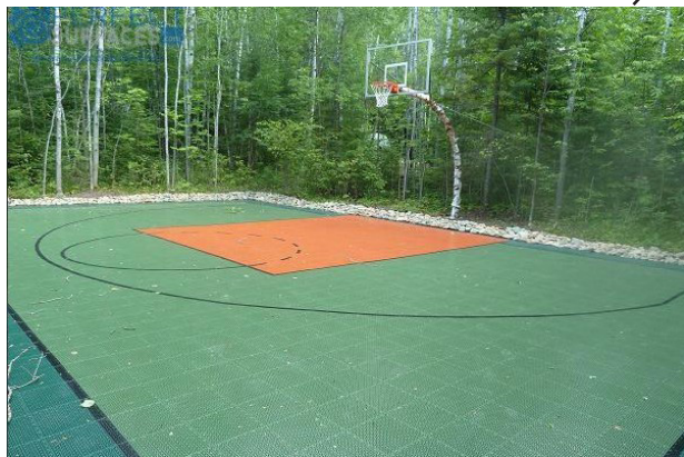
Refurbish existing 1/2-basketball surface and upgrade with proper hoop height / orientation and line markings.