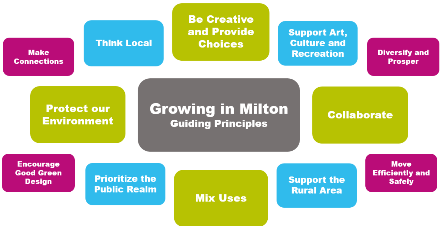
Figure 3. Growing in Milton’s Guiding Principles Hierarchy.

The Big Questions and Policy Considerations for the Growing in Milton theme are strongly tied to the Guiding Principles of: Be Creative and Provide Choice; Collaborate; Mix of Uses; and Prioritize the Public Realm. Other Guiding Principles are still relevant to the Growing in Milton Policy Considerations. They are also further discussed and supported through the exploration of the living, moving and working themes.