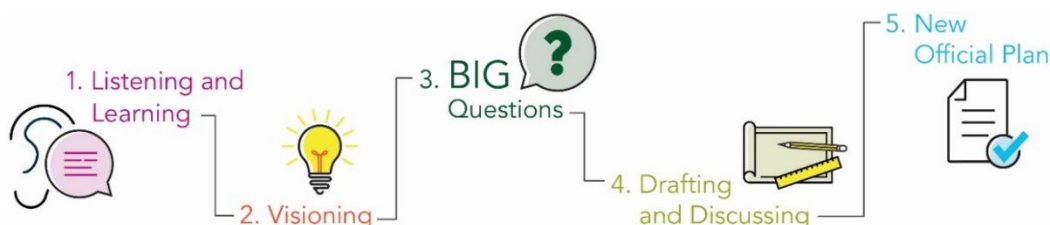
Figure 1. Milton’s Official Plan Review Process from engagement to policy.